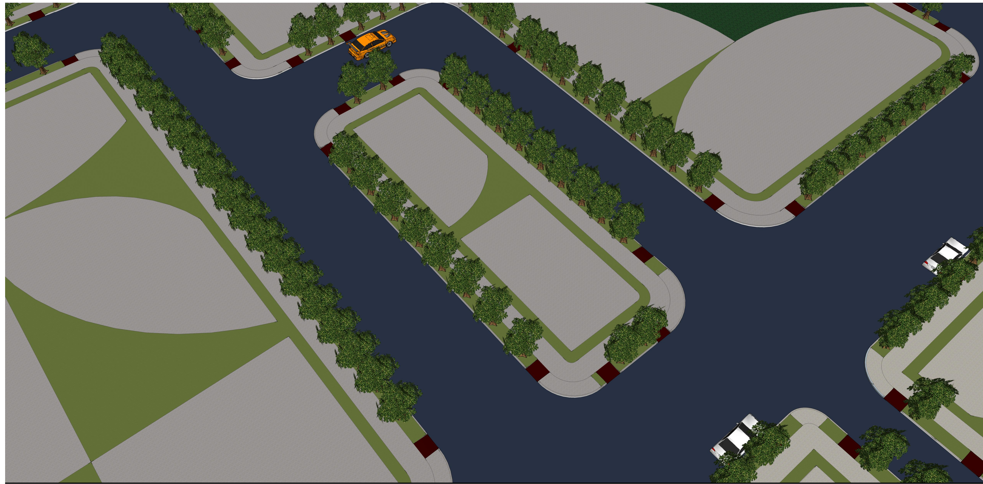
4 BLOCK 01 043 - SOUTHWEST VIEW G-004.92 SCALE: N.T.S

DESIGN FIRM: Ndengu Design, LLC. 1 Avenue C - Suite 100 Hudson City, Bayonne County, New Jersey 07002-3620 T: (000) 000-0000 F: (000) 000-0000 E: info@ndengudesign.com W: ndengudesign.com