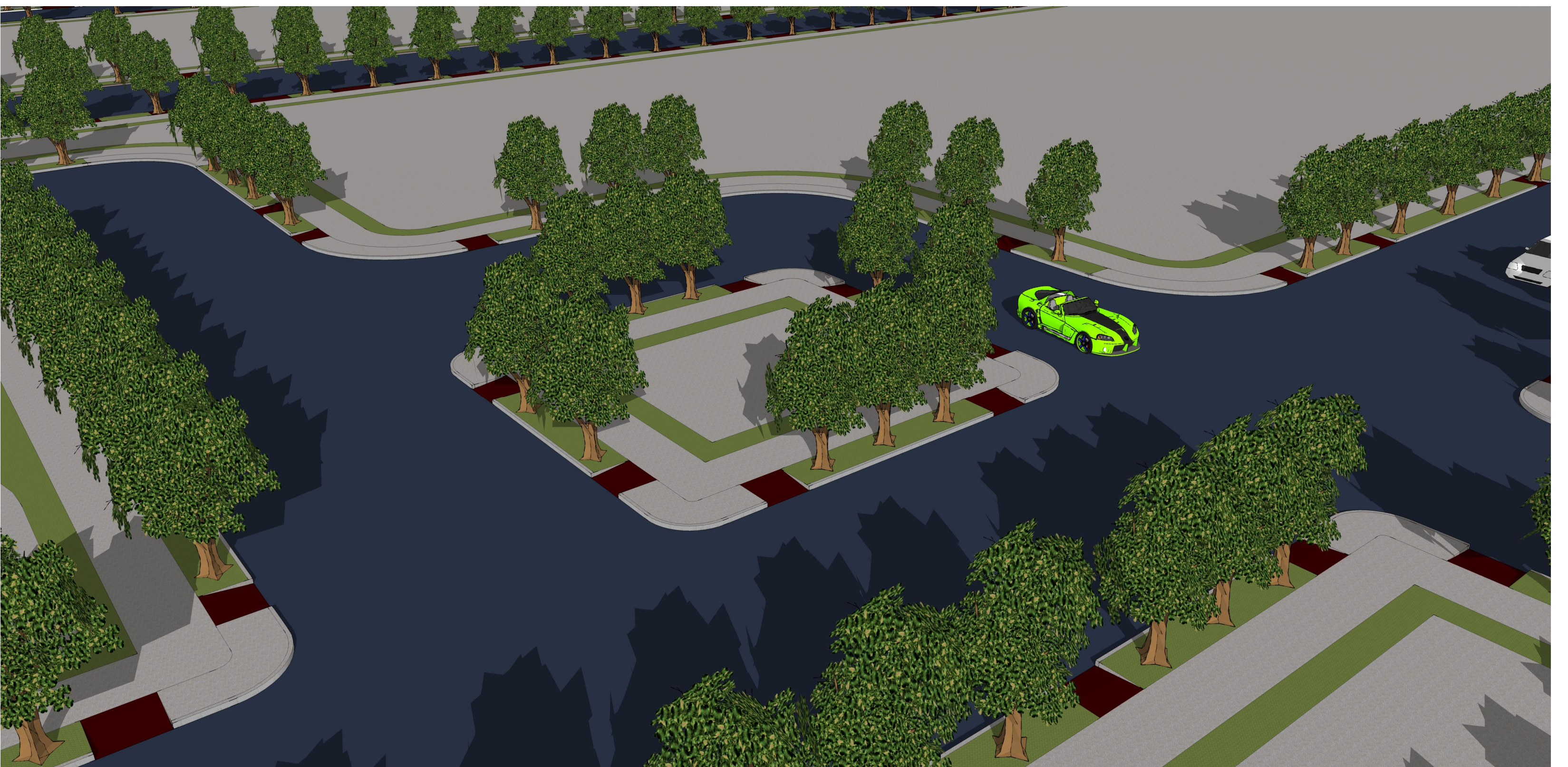
4 BLOCK 01 078 - SOUTHWEST VIEW