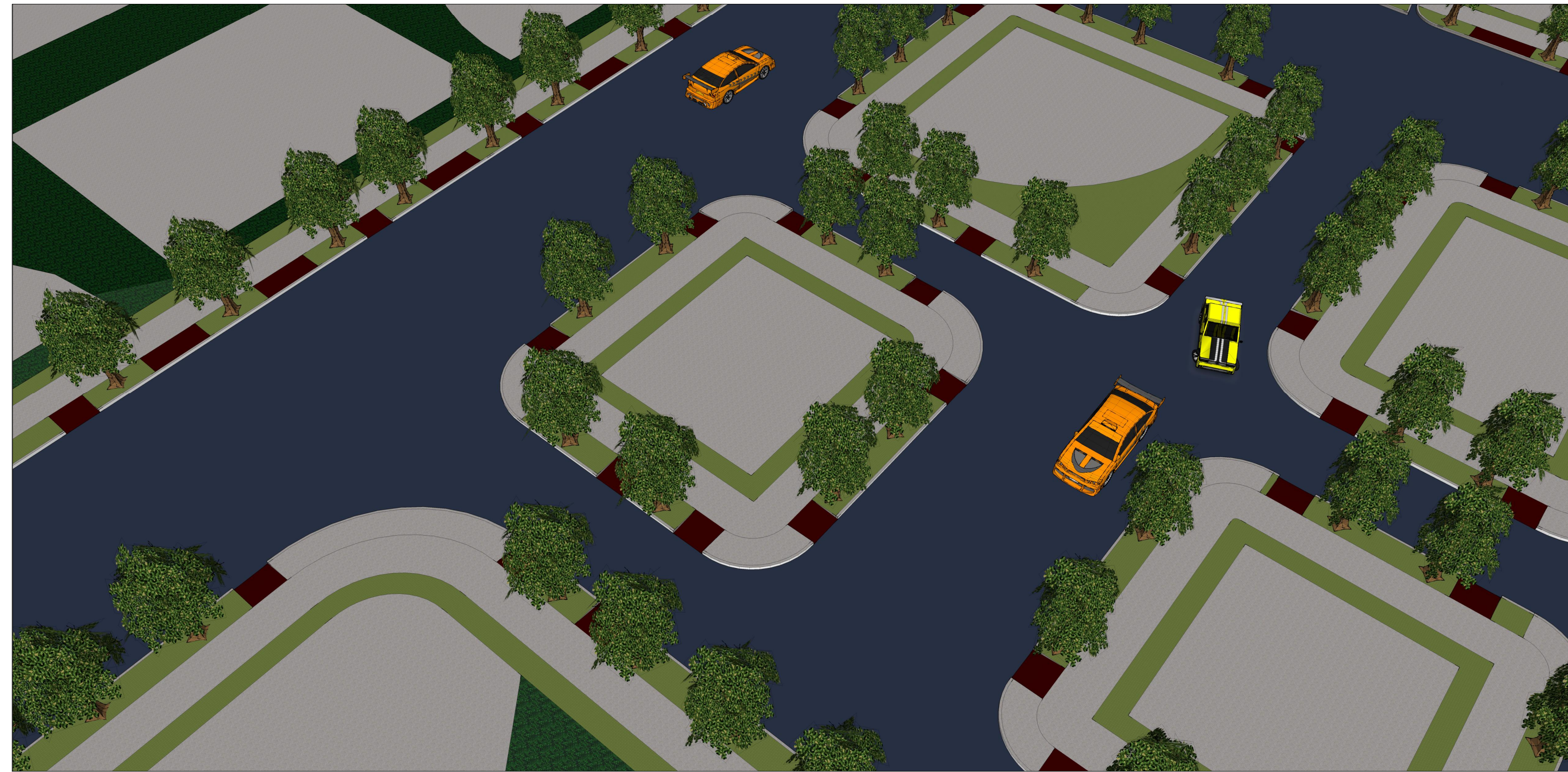
3 BLOCK 01 065 - NORTHEAST VIEW G-004.135 SCALE: N.T.S