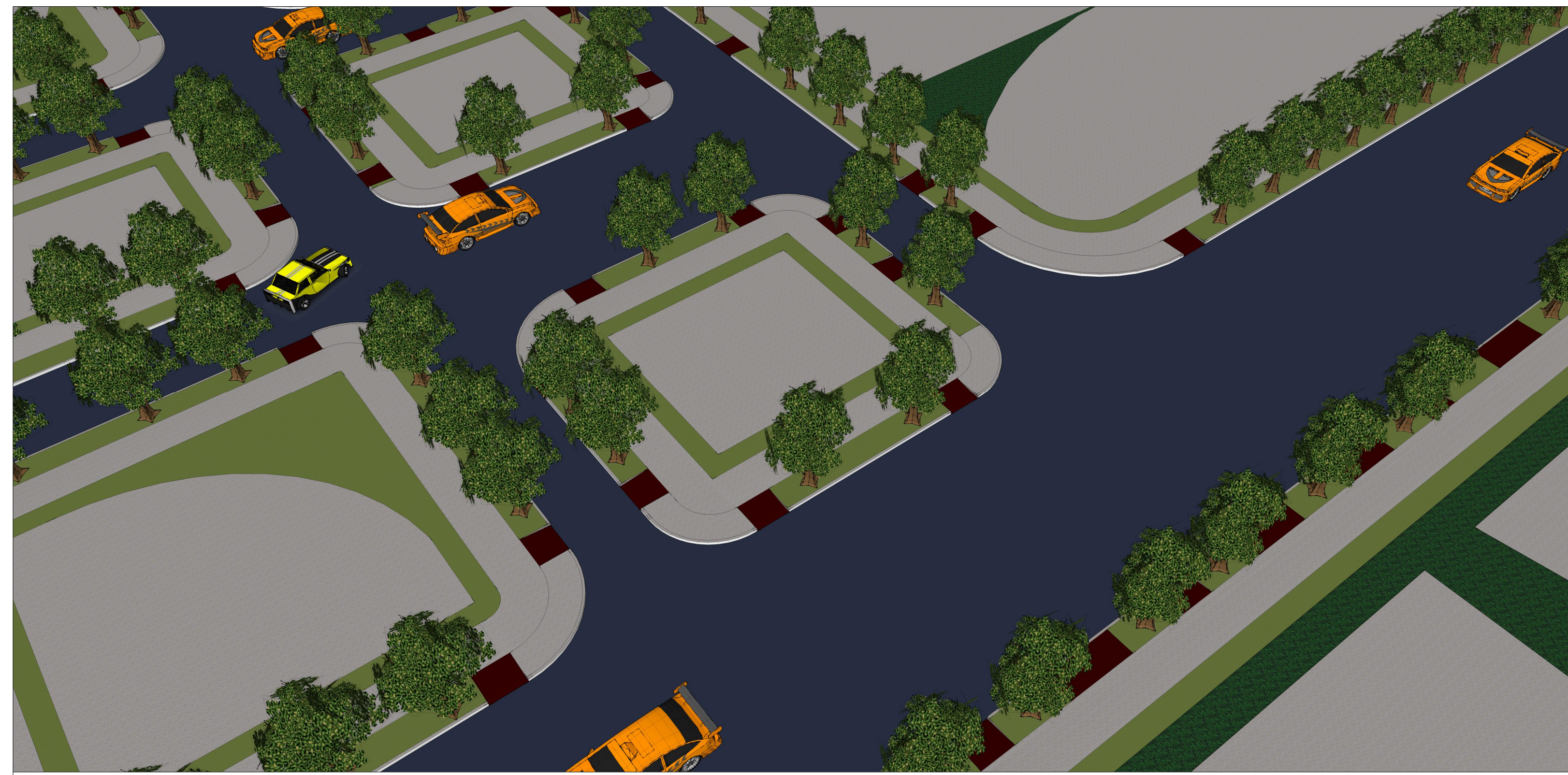
4 BLOCK 01 065 - SOUTHWEST VIEW G-004.135 SCALE: N.T.S

DESIGN FIRM: Ndengu Design, LLC. 1 Avenue C - Suite 100 Hudson City, Bayonne County, New Jersey 07002-3620 T: (202) 000-0000 F: (202) 000-0000 E: info@ndengudesign.com W: ndengudesign.com