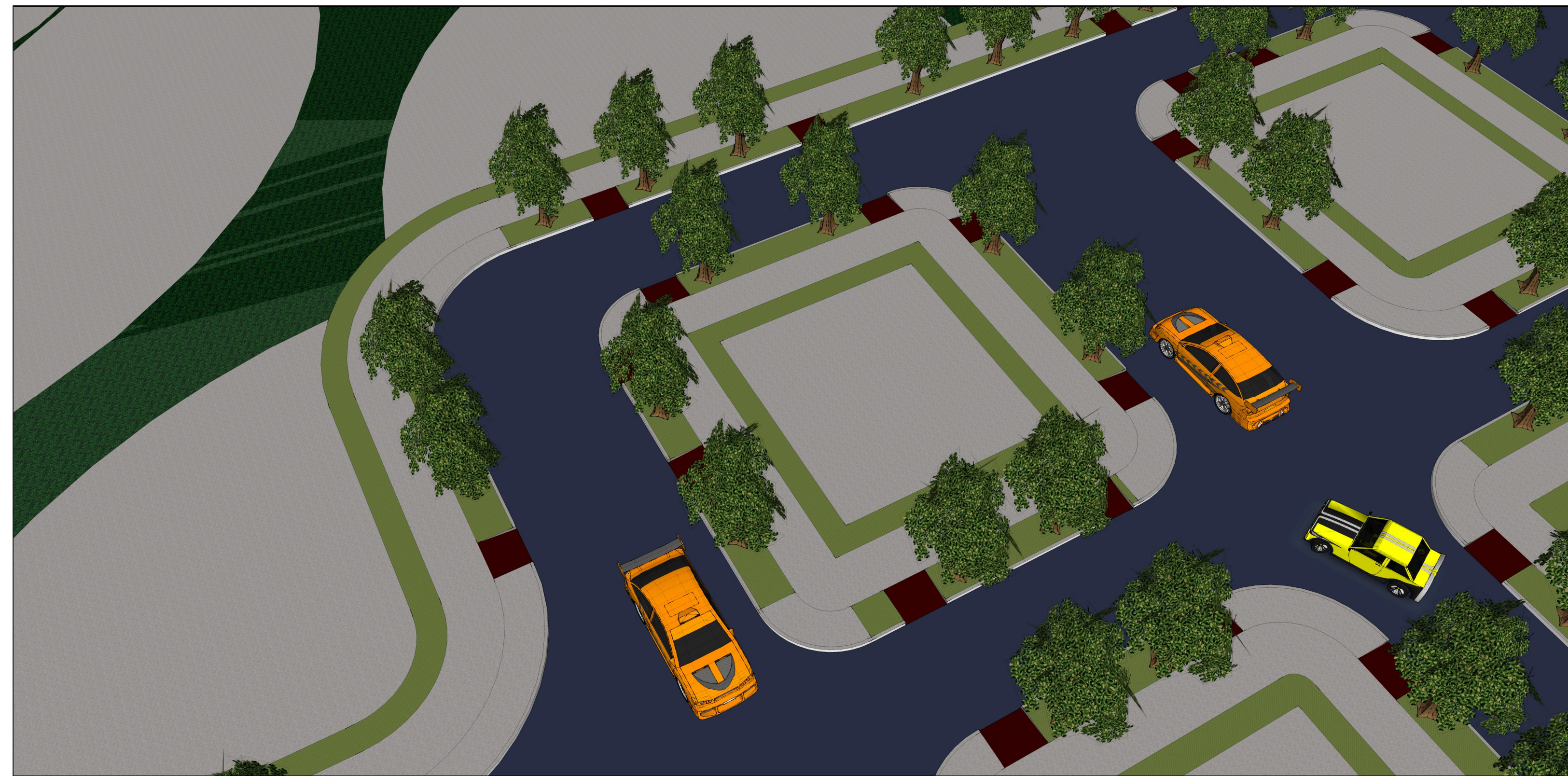
3 BLOCK 01 064 - NORTHWEST VIEW G-004.134 SCALE: N.T.S