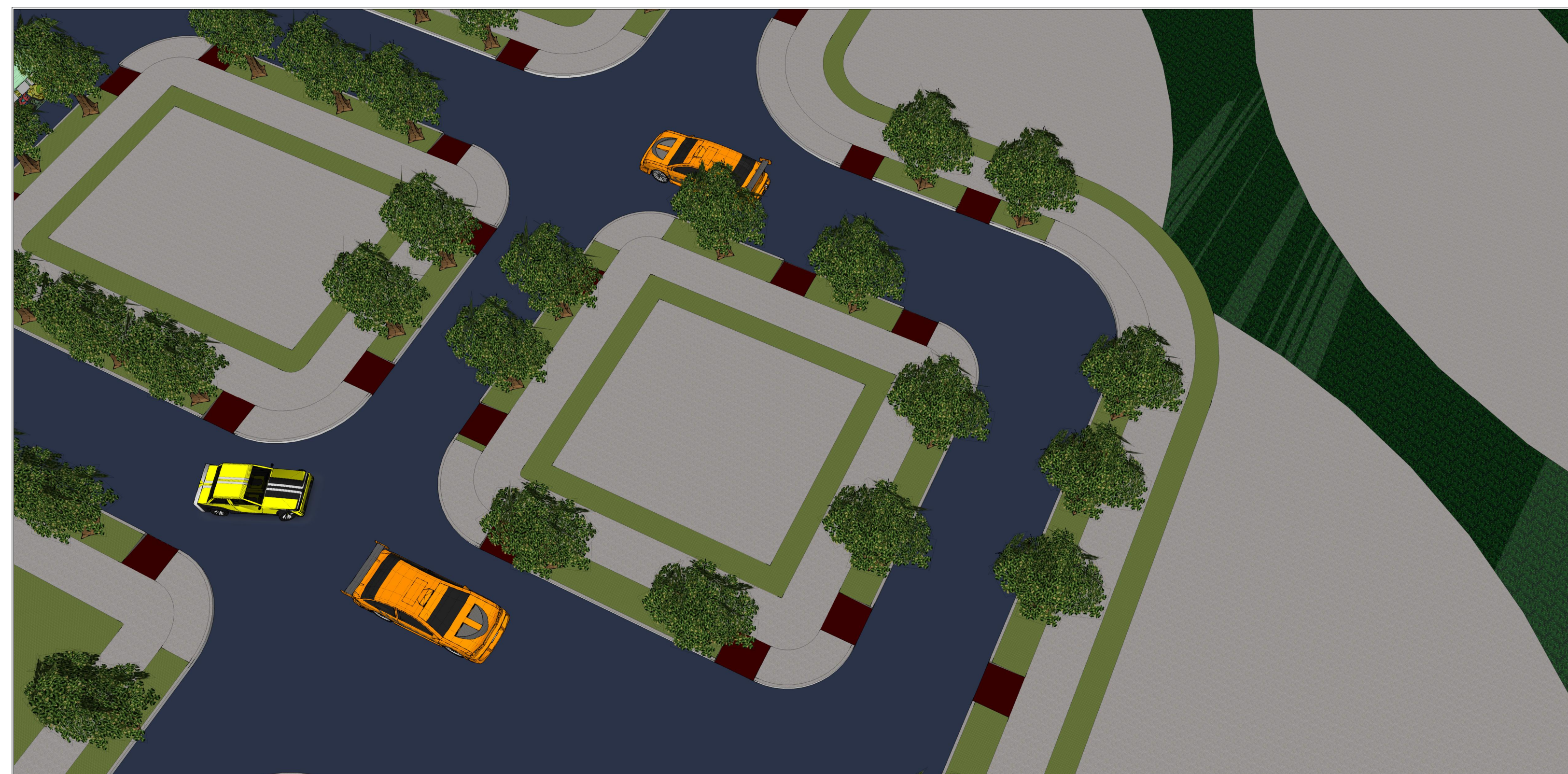
4 BLOCK 01 064 - SOUTHEAST VIEW G-004.134 SCALE: N.T.S

DESIGN FIRM: Ndengu Design, LLC. 1 Avenue C - Suite 100 Hudson City, Bayonne County, New Jersey 07002-3620 T: (908) 000-0000 F: (908) 000-0000 E: info@ndengudesign.com W: ndengudesign.com