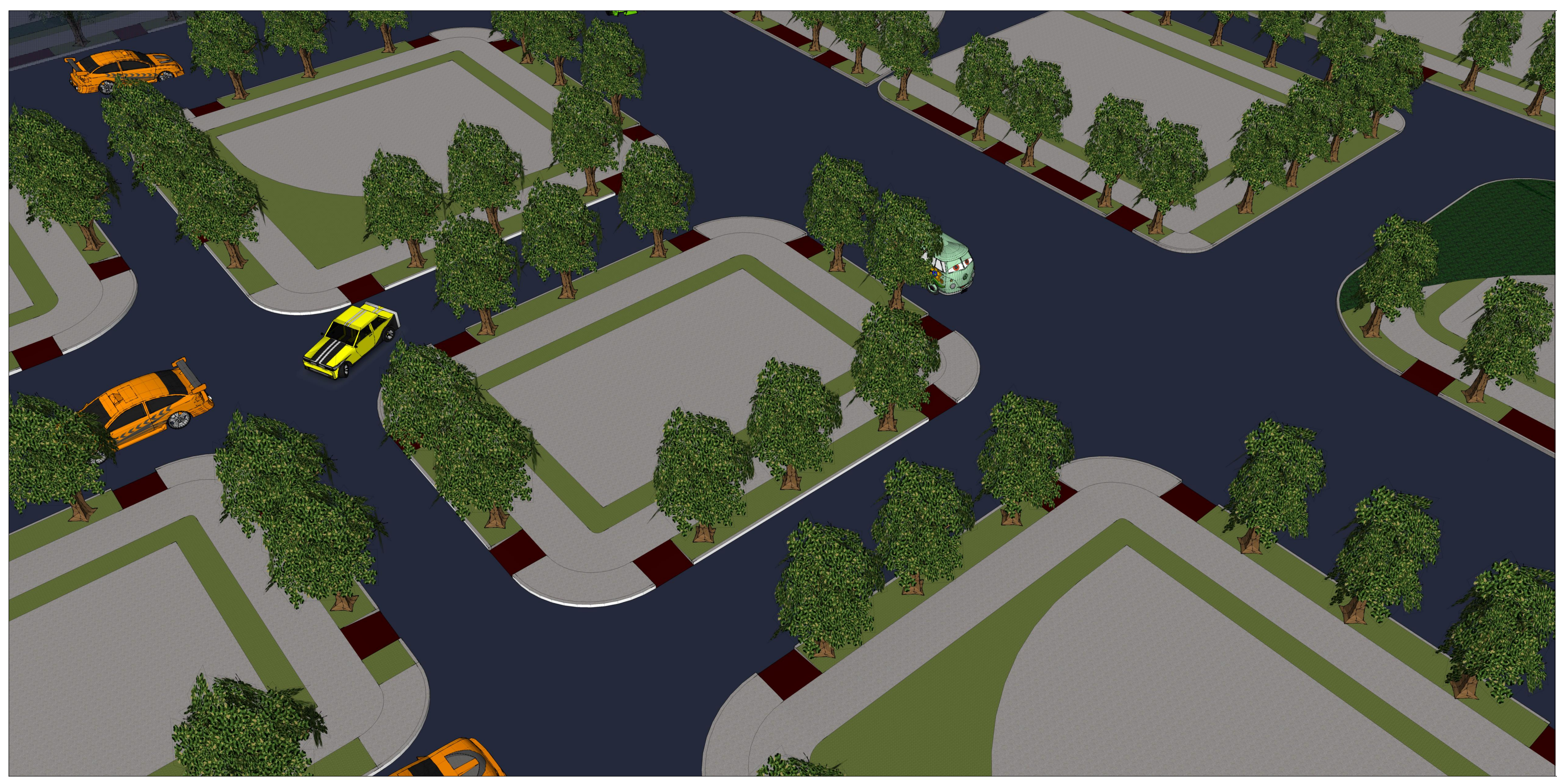
3 BLOCK 01 062 - NORTHEAST VIEW G-004.132 SCALE: N.T.S