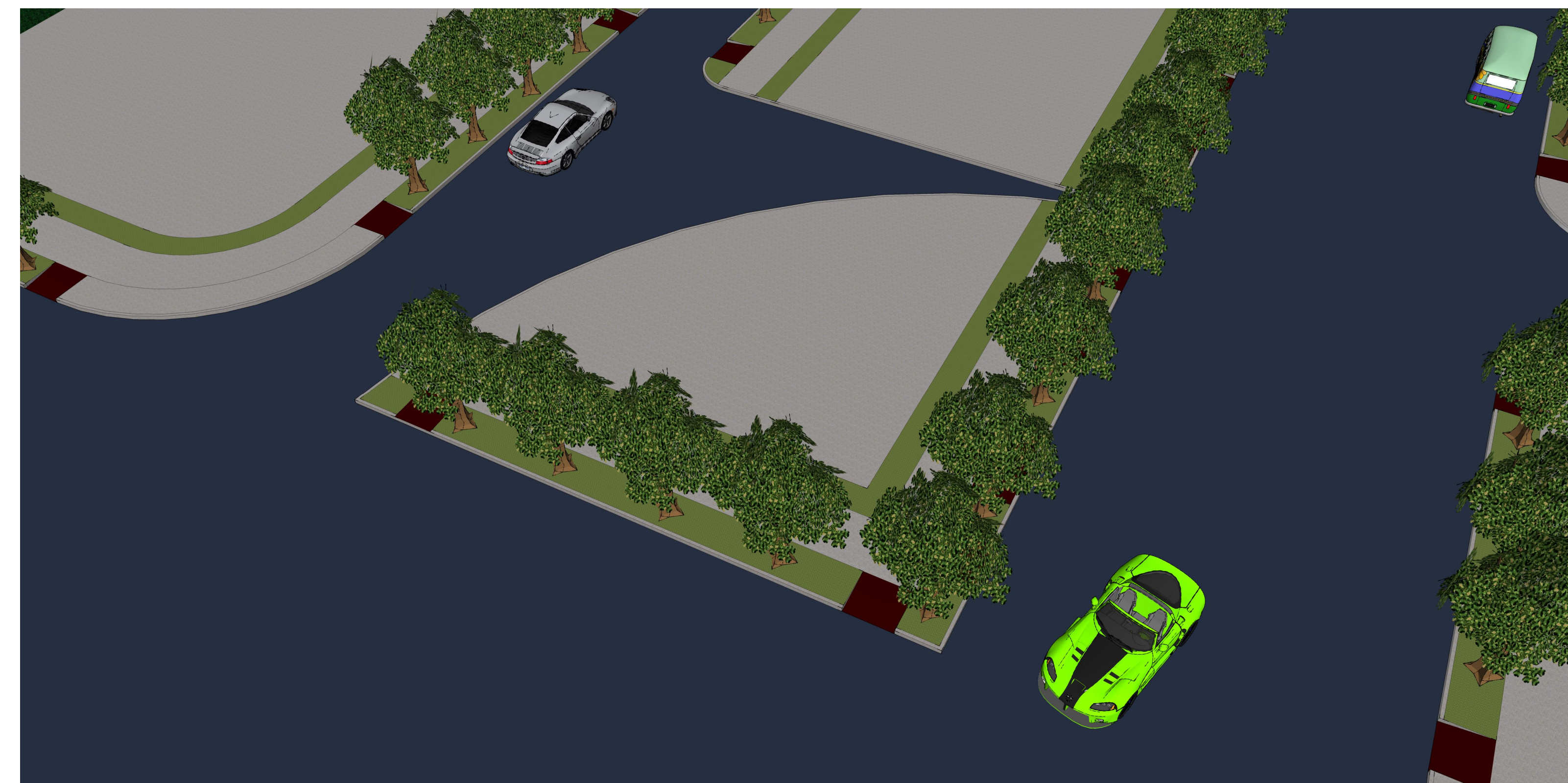
4 BLOCK 01 059 - SOUTHEAST VIEW G-004.119 SCALE: N.T.S

DESIGN FIRM: Ndengu Design, LLC. 1 Avenue C - Suite 100 Hudson City, Bayonne County, New Jersey 07002-3620 T: (908) 000-0000 F: (908) 000-0000 E: info@ndengudesign.com W: ndengudesign.com