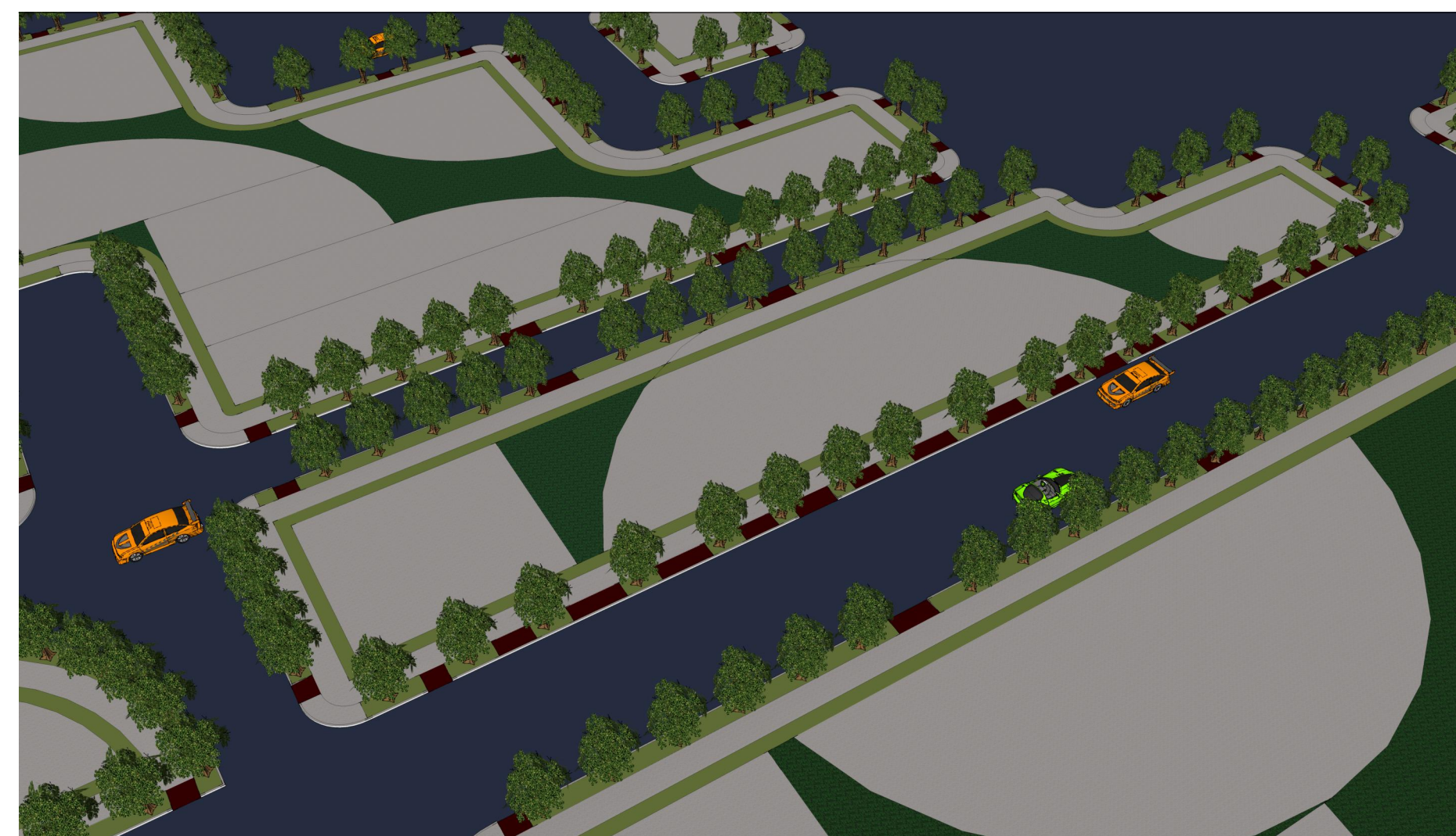
3 BLOCK 01 058 - NORTHEAST VIEW G-004.118 SCALE: N.T.S