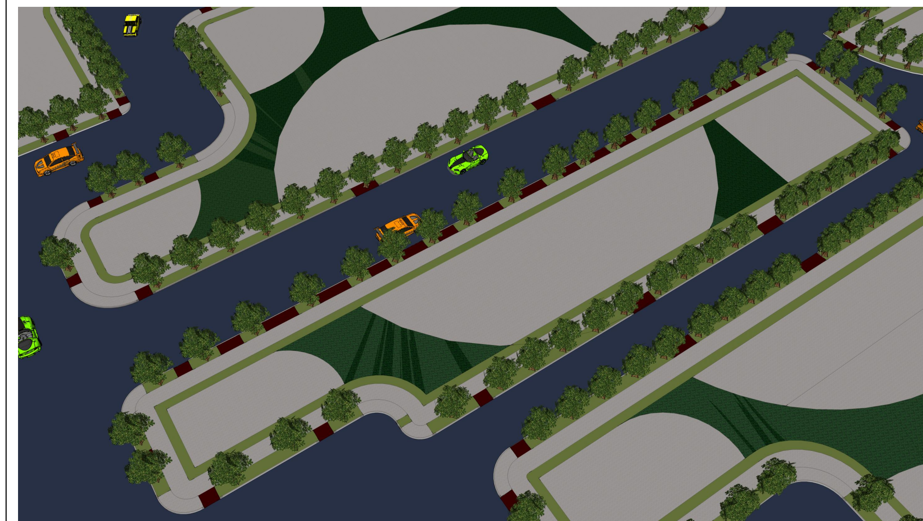
4 BLOCK 01 058 - SOUTHWEST VIEW G-004.118 SCALE: N.T.S

DESIGN FIRM: Ndengu Design, LLC. 1 Avenue C - Suite 100 Hudson City, Bayonne County, New Jersey 07002-3620 T: (908) 000-0000 F: (908) 000-0000 E: info@ndengudesign.com W: ndengudesign.com