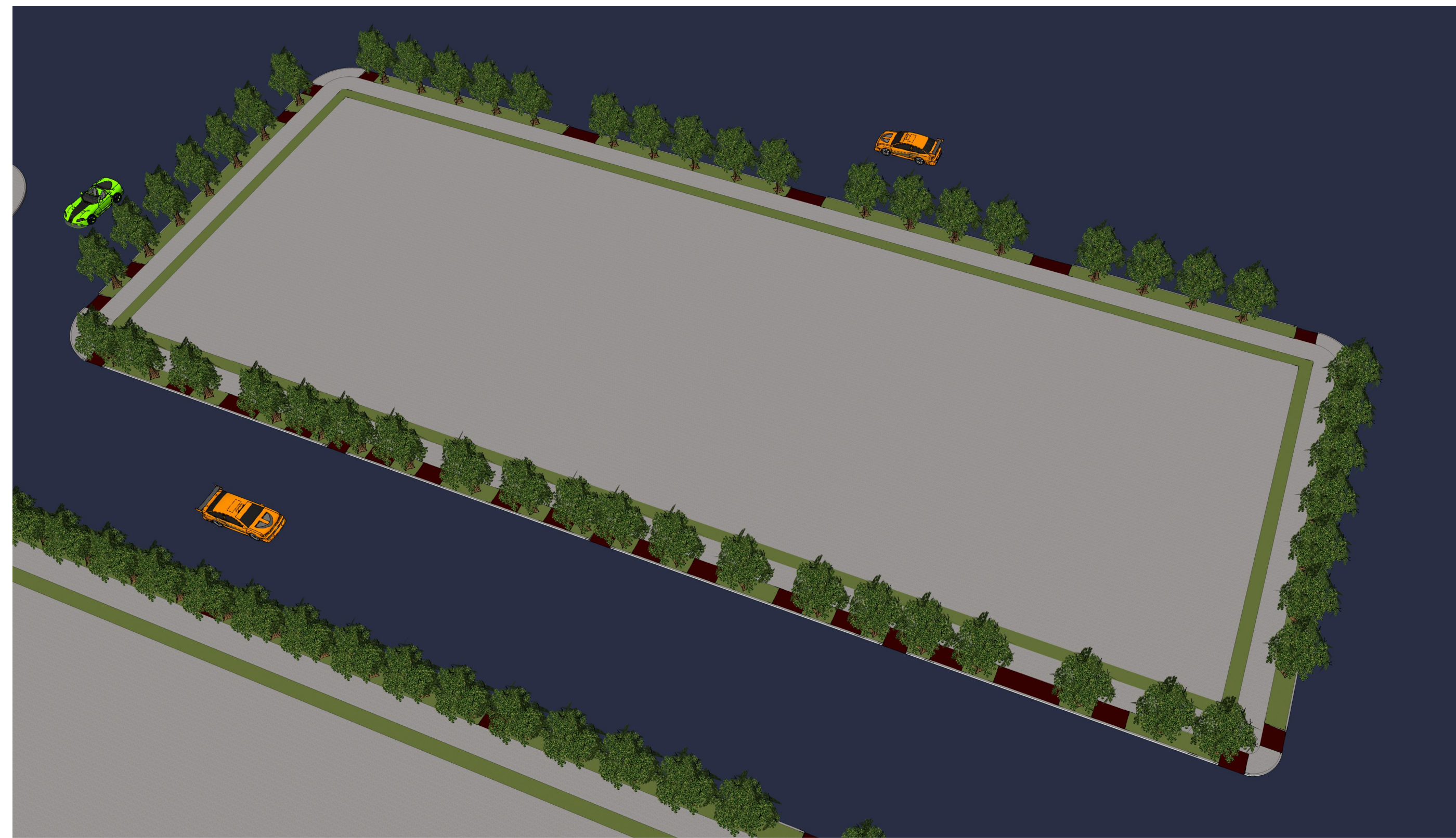
3 BLOCK 01 056 - NORTHWEST VIEW G-004.116 SCALE: N.T.S