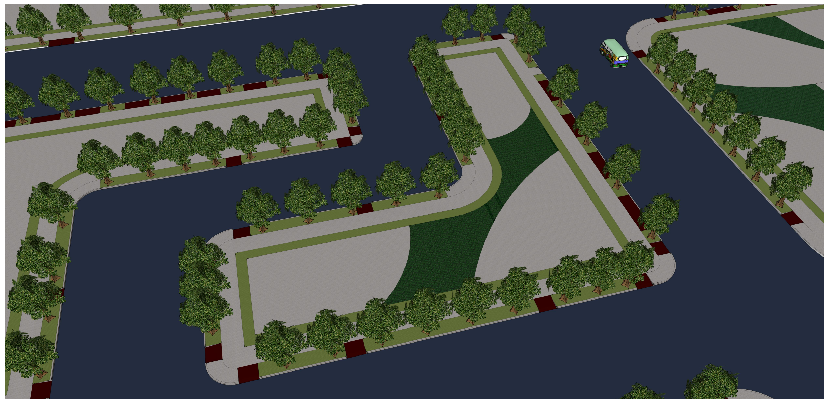
4 BLOCK 01 053 - SOUTHWEST VIEW G-004.113 N.T.S.

DESIGN FIRM: Ndengu Design, LLC. 1 Avenue C - Suite 100 Hudson City, Bayonne County, New Jersey 07002-3620 T: (908) 000-0000 F: (908) 000-0000 E: info@ndengudesign.com W: ndengudesign.com