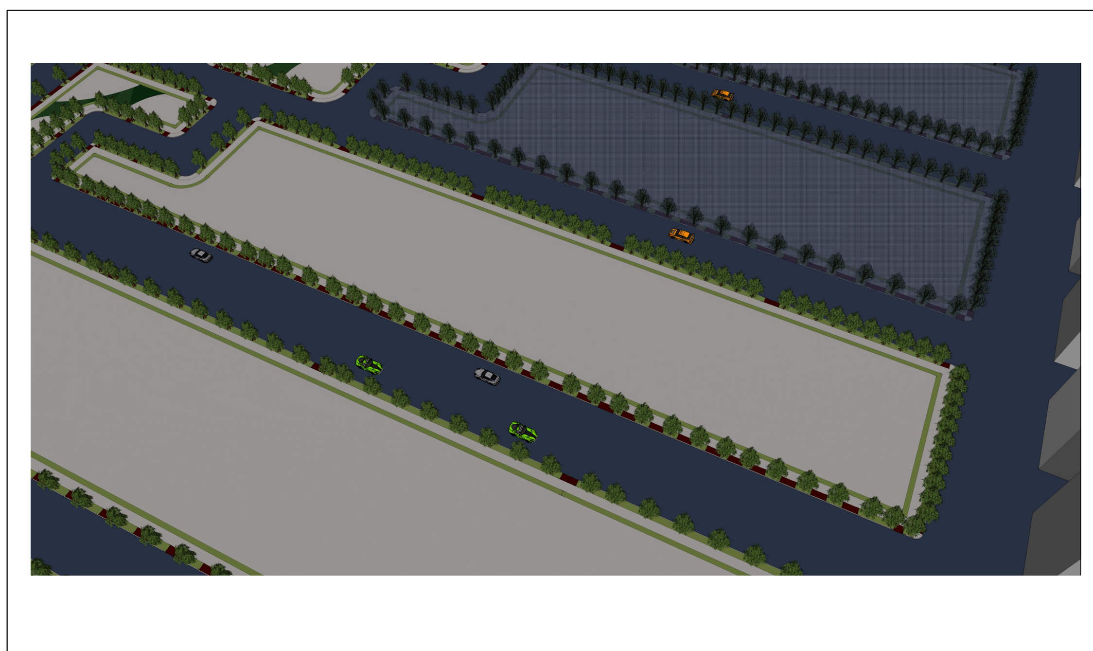
3 BLOCK 01 051 - NORTHWEST VIEW